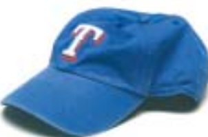
CAPS AND HATS