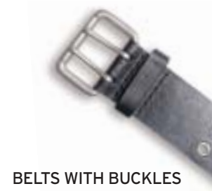
BELTS WITH BUCKLES